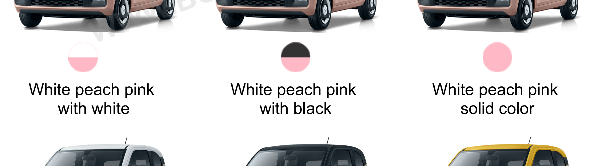
White peach pink with white