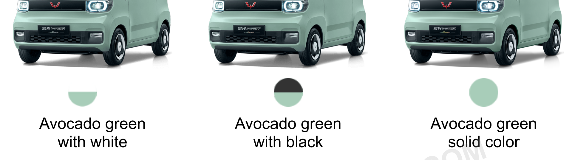
Avocado green with white