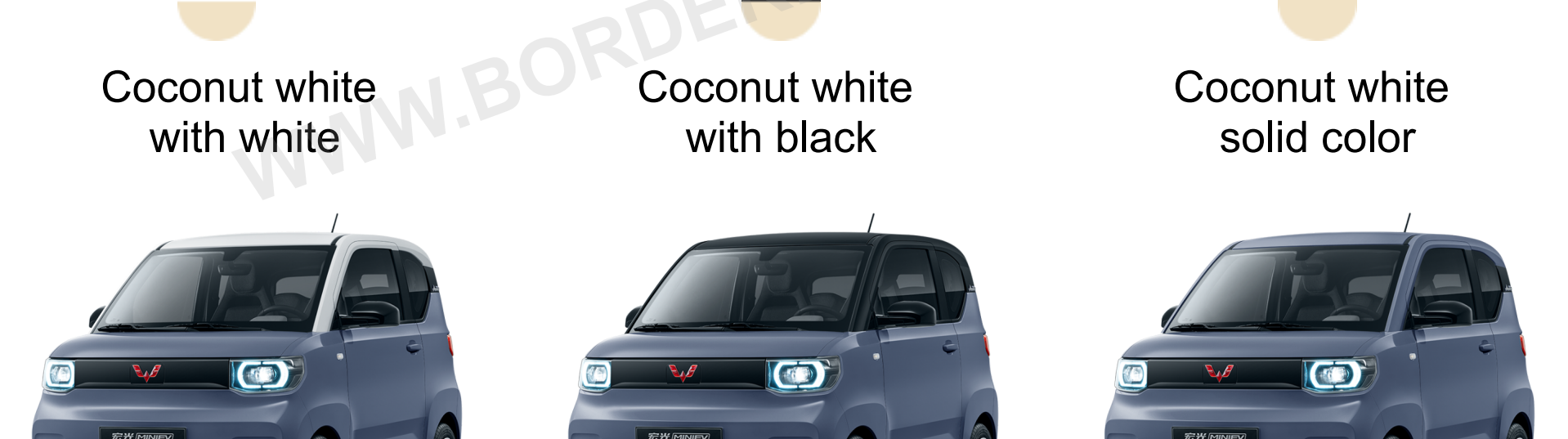
Coconut white with white