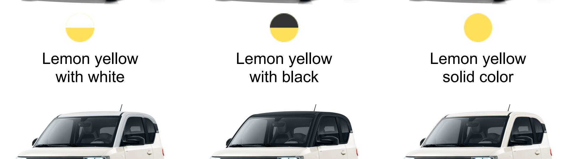
Lemon yellow with white